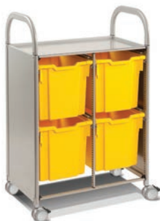
Double Cart with 4 Jumbo Trays