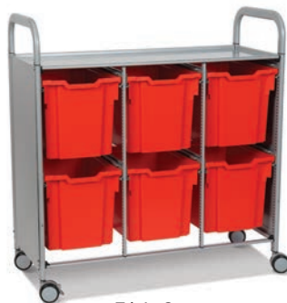
Triple Cart with 6 Jumbo Trays