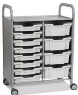
Double Cart with 8 Shallow & 4 Deep Trays