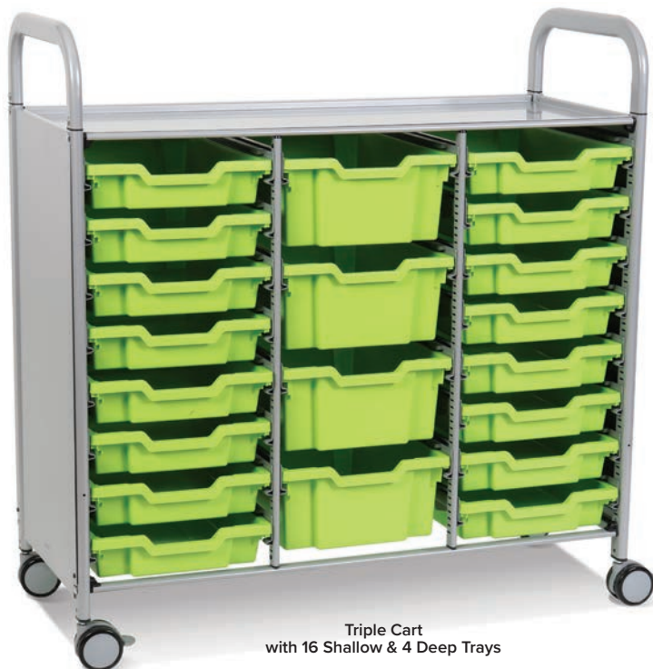
Triple Cart with 16 Shallow & 4 Deep Trays

Lesson time can be maximized with swift access to pre-prepared resources housed in the trays of the Callero cart. Supplies are transported effortlessly – and with stability – due to the large casters and ergonomic handles. The top surface of the cart can be used to model activities or display resources anywhere in the learning space, ensuring that all students get a front row view when it really matters.