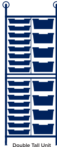
Double Tall Unit