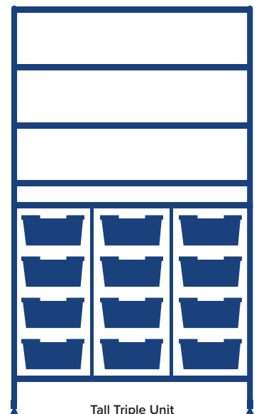
Tall Triple Unit