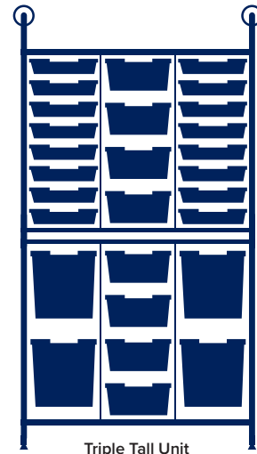
Triple Tall Unit